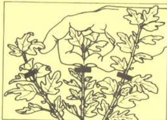
Pinch in early spring to encourage branching for shorter, fuller plants with more blossoms in the fall.